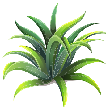
Choose Drought Tolerant Plants