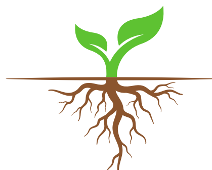
Water Deeply Less Often