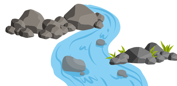
Channel Rainwater in Your Yard