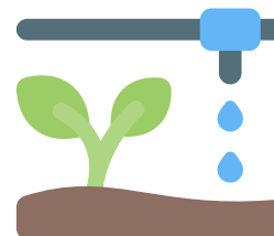
Use Drip Irrigation