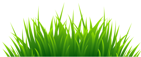
Eliminate Unused Grass