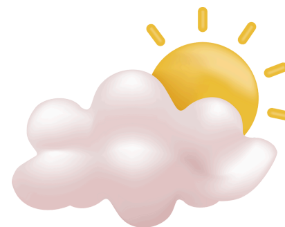
Water in the Morning